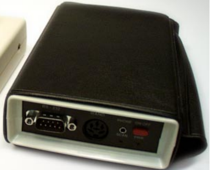
PDS-1 w/carrying sleeve