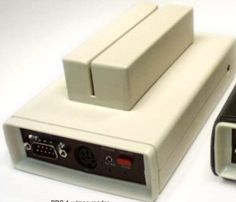
PDS-1 w/mag reader